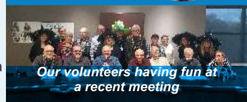
Our volunteers having fun at a recent meeting